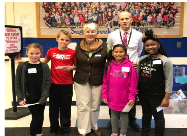
Representative Sondy Pope Visits Sugar Creek!

740 North Main Street Verona, WI (608) 845-4100